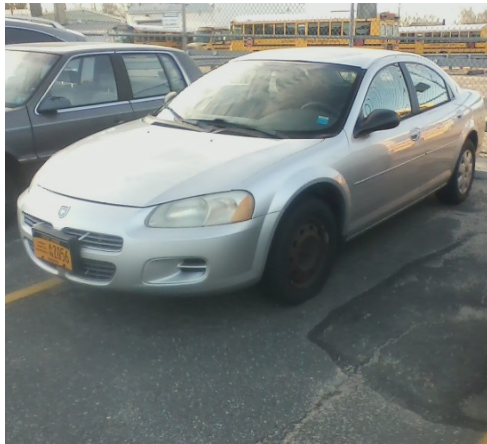
2002 Dodge Stratus (backup)