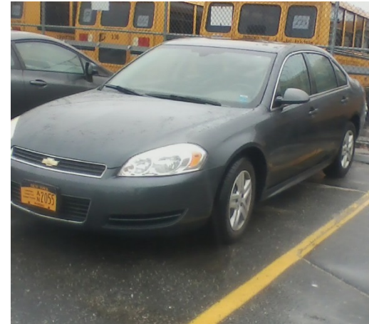
2010 Chevrolet Impala