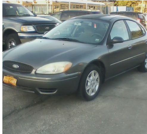
2004 Ford Taurus