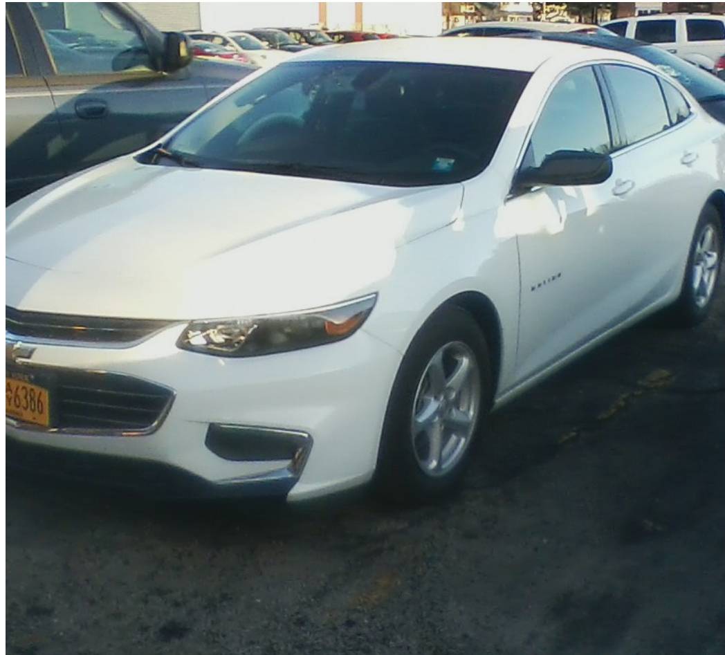
2017 Chevrolet Malibu