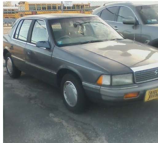
1991 Plymouth Acclaim (backup)